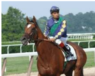
Bushfire