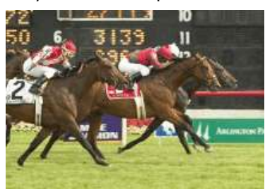
Kingship (center) wins a bobber

After finishing runner-up in an Oaklawn sprint maiden Mar. 5, Kingship was fourth going seven-eighths at Keeneland Apr. 15 and fifth at Churchill over six panels May 27. Bred top and bottom to appreciate the grass,