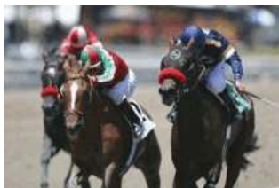
Somethinaboutlaura (blaze)

parts of a length behind her nemesis in the GII Milady Breeders' Cup H. June 3. Cutting back to a sprint for this, Somethinaboutlaura landed just off the pace and stalked from the outside to the far turn. Maryfield, who cut out the early fractions alongside Lady Bertrando (Bertrando), put that one away easily, but was immediately joined by Somethinaboutlaura, who put a head in front at the eighth pole and outgamed Maryfield for the win. Click for the brisnet.com chart or the free brisnet.com catalogue-style pedigree . Video, sponsored by Taylor Made.