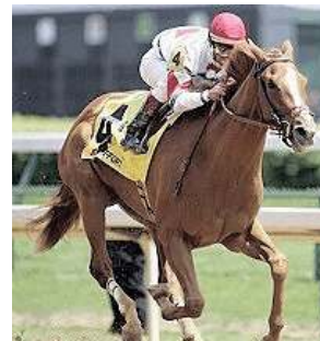
Joint Effort

The winner of the May 6 GIII La Troienne S. going 7 1/2 furlongs and the June 3 GIII Dogwood Breeders' Cup S. going a mile, Joint Effort (Runaway Groom) will try to stretch it out another furlong for the GI Mother Goose S. at Belmont today. The chestnut filly has tried a distance beyond the mile just once before, but had a rough trip in the 1 1/16-mile GII Darley Alcibiades S. at Keeneland last October and finished a too-