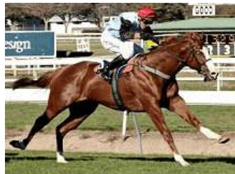
Jokers Wild Race Photo