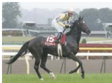
Dance in the Mood

A pair of Japanese stars worked in tandem at Hollywood Park yesterday with an eye on this weekend's lucrative turf events at the Inglewood oval. Asahi Rising