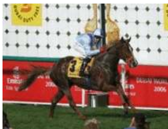
David Junior