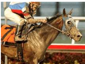
Brass Hat