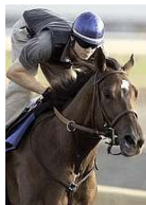
Wanna Runner

Trainer Bob Baffert opted to skip the Triple Crown trail with Wanna Runner to point for Canada's equivalent of the Kentucky Derby. Third behind Brother Derek in the Jan. 14 GII San Rafael S., the chestnut gelding was freshened after finishing fifth in the GIII El Camino Real Derby 15 days later. The Ontario-bred showed his appreciation for the break with a 4 3/4-length victory in the Apr. 1 WinStar Derby and comes off a 5 1/4-length romp in the May 13 GIII Lone Star Derby.