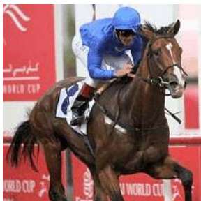
Discreet Cat