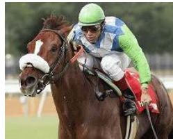
Showing Up