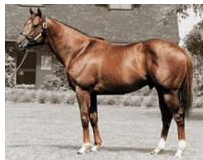
Distorted Humor

DISTORTED HUMOR'S DAM DEAD Jess Jackson's Danzig's Beauty (Danzig--Sweetest Chant, by Mr. Leader), a Grade II winner and the dam of leading sire Distorted Humor, was euthanized at Jackson's