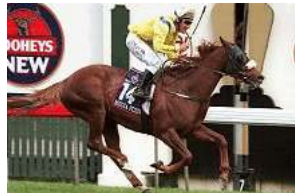
Media Puzzle (1997-2006)