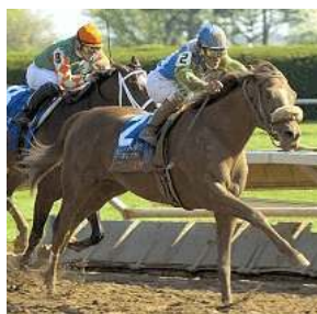
Showing Up winning the Lexington Pat Lang

The 1 3/16-mile Turf Cup, the first leg of the $5 million Jacobs Investments Grand Slam of Grass, is shaping up to be a contentious affair. Ten members of