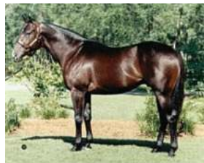
Tiger Ridge