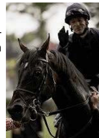
Yeats Getty Images