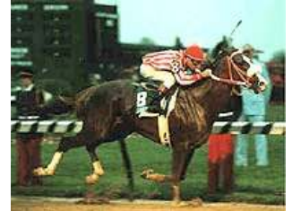
Sunny's Halo