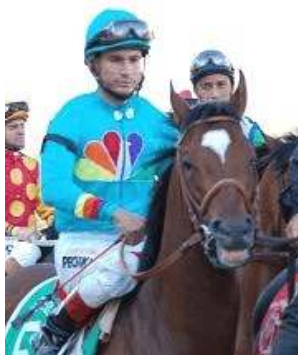
Brother Derek Sherackatthetrack

BROTHER DEREK TO POINT FOR HASKELL GI Santa Anita Derby hero Brother Derek (Benchmark), fourth in both the May 7 GI Kentucky Derby and May 21 GI Preakness S., will be pointed for the Aug. 6