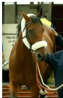
Distinction