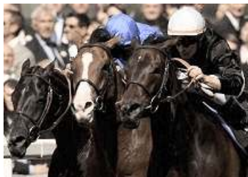
Ouija Board (right)

Also Ran: David Junior, Notnowcato (GB), Corre Caminos (Fr), Ace (Ire).