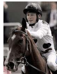
Soviet Song Getty Images