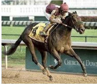
Bending Strings

the winner's circle, the 2005 GII Chilukki S. at Churchill Downs. She was also runner-up in the GI Test S., GI La Brea S. and GI Go for Wand H. Her earnings totaled $870,612.