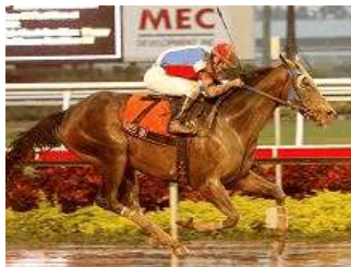
Brass Hat