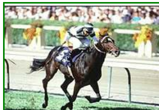
Last Tycoon (1983-2006)

LAST TYCOON DIES Champion Last Tycoon (Ire) (Try My Best--Mill Princess {Ire}, by Mill Reef), winner of the 1986 GI Breeders' Cup Mile, died May 27 at