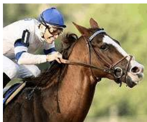
Buzzards Bay