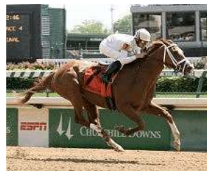
Venetian Sunset (2002-2006)

The highly regarded four-year-old Venetian Sunset (Old Trieste--Shining Through, by Deputy Minister) was euthanized earlier this week after sustaining a fractured cannon bone during a workout at Belmont Park, according to Daily Racing Form . The $1.4-million KEESEP purchase had won three of four career starts, including a track-record setting performance at Gulfstream Mar. 11 ( video ) and a 7 3/4-length allowance tally at Churchill May 5 ( video ). Trained by Todd Pletcher for WinStar Farm, the chestnut was a half-brother to British Group 1-winning sprinter Bahamian Pirate (Housebuster) and to MGSW Strong Hope (Grand Slam).