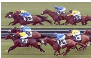
La Coupe finish

Blue Monday (GB) (Darshaan {GB}) survived a steward's inquiry to earn his first group success in yesterday's G3 La Coupe S. at Longchamp. Successful in the valuable Cambridgeshire H. at Newmarket Oct. 1, the five-year-old confirmed his well-being when second on seasonal return at Ripon Apr. 20. He emphasized that further with a win in the May 26 Listed Festival S. at Goodwood. Settled in third for most of yesterday's contest, Blue