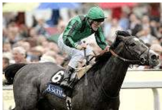
Proclamation Action Plus

Godolphin's Proclamation (Ire) (King's Best) will have a maximum of eight rivals to face in Tuesday's G1 Queen Anne S. at Royal Ascot. Last year's G1 Sussex S. hero missed his intended return in the May 20 G1 Lockinge S. That race was won by Cheveley Park Stud's five-year-old mare Peeress (GB) (Pivotal {GB}), who also featured among the entries at yesterday's Queen Anne five-day stage. Her trainer Sir Michael Stoute also has Khalid