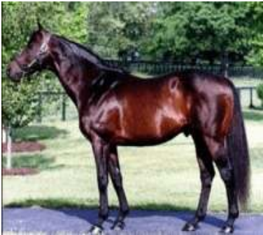
Seeking the Gold claibornefarm.com