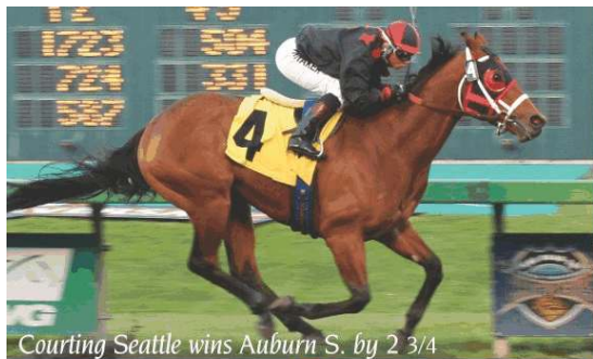
Courting Seattle wins Auburn S. by 2 3/4