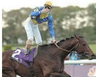
Shirocco winning the Breeders' Cup Turf