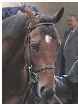
Deputy Glitters Sherackatthetrack