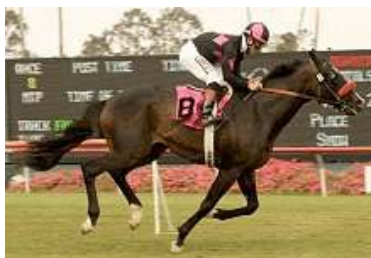
Lava Man

was preceded by a victory in the Mar. 4 GI Santa Anita H. and before that a romp in the $1-million Sunshine Millions Classic Jan. 28. A Grade I win on the grass here would be an impressive addition to a resume that includes his 2005 wins in the Gold Cup and GII Californian S. Standing in his way is a talented group of turfers, including Red Fort , runner-up in this event last year. The six-year-old went missing for over 10 months off that one, and finished a solid fourth to Willow O Wisp in the 8 1/2-furlong GIII Inglewood H. Apr. 29 in his comeback. He will appreciate the added ground here. King's Drama comes off a popular win in the Mar. 25 GII San Luis Rey H., which pushed his earnings past the million-dollar mark.