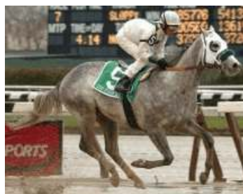
Too Much Bling

Trainer Bob Baffert missed a win in this race in 2001, then run under its former moniker, when Flame Thrower was second by a neck in the final start of his career; and by a head in 2004 when Teton Forest was tagged