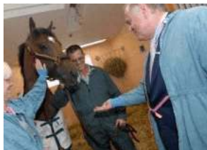
Gov. Rendell visits Barbaro

Medicine's New Bolton Center, the current home of GI Kentucky Derby hero Barbaro (Dynaformer), was presented with a check of $13.5 million for new medical facilities by Pennsylvania Governor Ed Rendell yesterday. "This money is an investment in Pennsylvania's ability to treat animals from across the country, and to provide top-notch educational