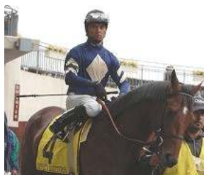
Deputy Glitters