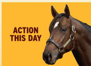
ACTION THIS DAY