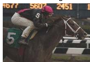
Mayan King