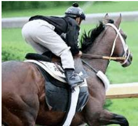
Bluegrass Cat