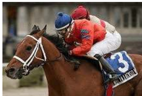
Magnolia Jackson