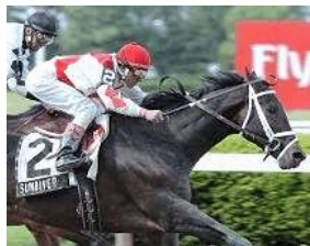
Sunriver

that we've had him. Around the barn, we were talking about him being our sleeper in January, February and March." Bluegrass Cat has been away since his runner-up finish to Barbaro in the GI Kentucky Derby May 6, and attempts to become the fourth colt in the last six years to win the 12-furlong Classic after skipping the GI Preakness S. The bay has Pletcher's main man John Velazquez aboard and has drawn the nine hole. That Velazquez is able to take the mount on Bluegrass Cat is significant. It originally was thought that the Puerto Rican, injured in a spill Apr. 20, would be on the sidelines until late summer. But fans of Velazquez had to wait just six weeks to see him return to the saddle. Last Friday, he won a Belmont allowance race in his first start back. The horse's trainer? Todd Pletcher. "He's recovered quicker than we could have hoped for," said Pletcher. "We weren't sure when it first happened whether he would be back for Saratoga, even. So he's healed really quickly, and he's come back and ridden well a couple of times already in the past week." Velazquez, who like Pletcher has never won a Classic race, has been aboard Bluegrass Cat in six of the colt's eight races, including his win in the GIII Nashua S. over the Belmont strip last October. Belmont cont. p2