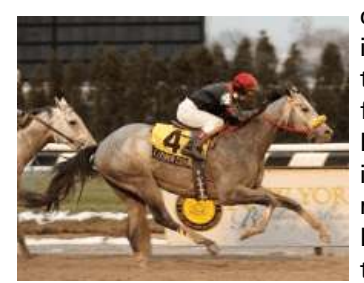
Platinum Couple

Platinum Couple (Tale of the Cat) breezed three furlongs over Belmont's main track Tuesday, covering the