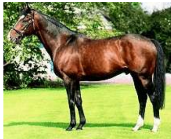
Sadler's Wells

Sadler's Wells was responsible for two runners in the Oaks, the other being Cheshire Oaks winner Time On, and five in the Derby, including the 2006 stakes winners Septimus, Linda's Lad and Atlantic Waves. Sadler's Wells has also hit the group target this year with his older sons Day Flight, Percussionist and Policy Maker, and he could have several candidates for the Irish Derby and the St Leger, one likely type being Puerto Rico,