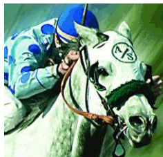
CARTHAGE G3 winner in 2006