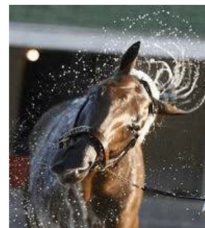
Bluegrass Cat

With the main track at Belmont Park turned to mud by the recent rains, trainer Todd Pletcher opted to work G1 Belmont S. hopefuls Bluegrass Cat (Storm Cat) and Sunriver (Saint Ballado) over the training track yesterday morning. "It was safe," Pletcher said. "It will probably be a little different [Tuesday], but I wanted to get it done [yesterday]." G1 Kentucky Derby runner-up Bluegrass Cat, with Eddie King up, went five furlongs in 1:01.72 over the "good" surface.