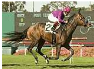
Attima

Lightly-raced Attima (Zafonic) gave connections reason to believe that they had made a wise investment when she galloped off to an impressive 3 1/2-length score in her U.S. debut May 10, but the English-bred looked like a steal when she made short work of six