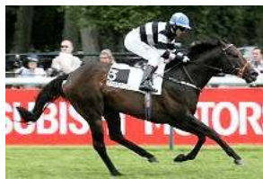
Moss Vale