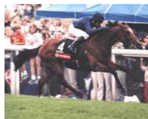
Coolmore Stallion Galileo www.coolmore.com

OPENER A yearling colt by Galileo (Ire) out of Sogno (NZ) (Zabeel {NZ}) brought a final bid of A$140,000 to top the opening session of the Magic Millions National Sale on the Gold Coast yesterday. Consigned by