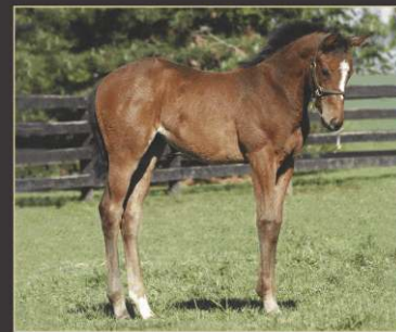
f. o/o Cherry Flambe-G3 , by Explosive Red