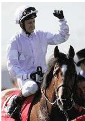
Sir Percy

There were four horses on the line at the finish of the 227th renewal of yesterday's G1 Vodafone Derby at