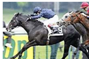
Aussie Rules Scoop Dyga

for a long time that he is a very gifted colt." No Classic stone is left unturned by the might of Ballydoyle, and in Susan Magnier, Michael Tabor and Faisal Salman's G1 Poule d'Essai des Poulains winner Aussie Rules (Danehill), the operation has a strong player. He is bred to go the extra distance and was finishing with effect when beating Marcus Andronicus (Ire) by a half length in the mile Classic.