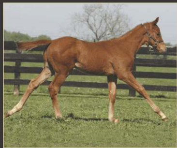
c. o/o Favorite Ending , by End Sweep

Nayyir rolled back the years under a perfectly judged ride from Frankie Dettori to win this race for the second time. Much water had flowed under the bridge since his three-length romp four years ago, with the chestnut winning the 2002 G2 Challenge S., and two renewals of Goodwood's Lennox S., run as a Group 3 in 2002 and as a Group 2 a year later. He also finished third in the G1 Dubai Duty Free S. at Nad al Sheba and runner-up to Soviet Song (Ire) in the G1 Sussex S. at his favored Goodwood in 2004, but his powers had appeared on the wane recently and he was only fourth in the Listed Magnolia S. at Kempton Apr. 15. Observing from rear in customary fashion throughout the early stages, he was threaded through the gaps inside the final quarter to cut down Boule d'Or in the final 50 yards, as the luckless favorite Home Affairs flashed late. "He is one of my favorites--he digs us out of a hole all the time and this is one of his best performances." Click for the racingpost.co.uk chart.