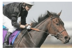
Ouija Board (GB)

A compact but select six-horse field lines up in today's G1 Vodafone Coronation Cup at Epsom, with the likes of last year's G1 Breeders' Cup Turf one-two Shirocco (Ger) (Monsun {Ger}) and Ace (Ire) (Danehill) joined by super filly Ouija Board (GB) (Cape Cross {Ire}). Coronation Cup, p5