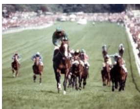
Shergar winning the 1981 Derby by 10 lengths

It's been a full quarter-century since His Highness the Aga Khan's Shergar (GB) opened up to score by a record-setting 10 lengths in the G1 Epsom Derby. To-