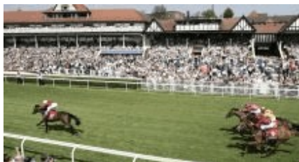
Time On romps in the Cheshire Oaks

Decades of tradition will be on display in today's G1 Vodafone Oaks at Epsom, with the jackets of four past heroines set to be graced in this renewal. Robert