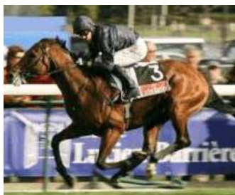
Horatio Nelson Wyvern Int'l