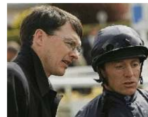
Aidan O'Brien & Kieren Fallon