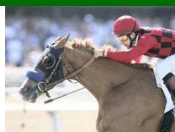
SHINING ENERGY

In the last ten days, SHINING ENERGY became his 10 th Grade 1 winner at Hollywood Park and WILD SHOUT in Japan became his 11 th millionaire.