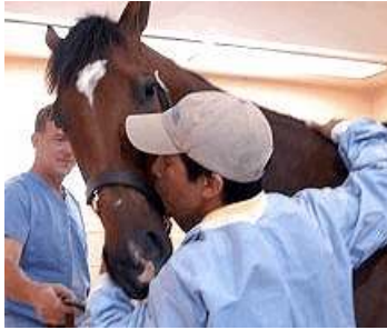
Edgar Prado busses Barbaro