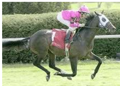
Prince Arch

PRINCE ARCH RETIRED Grade I winner Prince Arch (Arch--Princess Kris {GB}, by Kris {GB}) has been