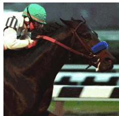
Mr. Greeley... SIRE OF SIRE El Corredor, G1 Winner and Leading Freshman and Sophomore Sire