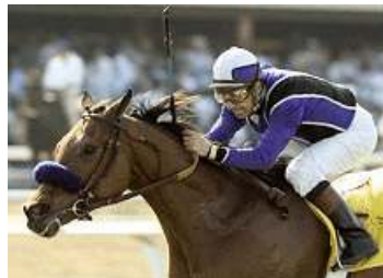
Willow O Wisp

Willow O Wisp is three-for-four on the Hollywood lawn, including a two-length tally in the GIII Cinema BC H. last June. He followed that effort with victories in the Aug. 13 GII La Jolla H. and Sept. 5 GII Del Mar Derby, but tired to be ninth in the G1 Hong Kong Cup in December. Suffering through a tough trip in his 2006 opener, the bay gelding trailed the field under the wire in the Jan. 28 Sunshine Millions Turf S., and was given a break after weakening to seventh behind Milk It Mick and Aragorn in the Mar. 4 GI Frank Kilroe Mile H. He rebounded with a front-running score in the Apr. 29 GIII Inglewood H. and will be the one to catch here. Milk It Mick was third behind Silent Name in the Apr. 8 GII Arcadia H., then shipped to Louisville and filled the show spot once again in the May 6 GI Woodford Reserve Turf Classic. Aragorn made his latest start in the Apr. 29 GII San Francisco BC H. at Golden Gate. Sent off the 7-5 chalk, he had to settle for second behind Charmo in that one-mile contest. The gray five-year-old Charmo followed back-to-back allowance wins at Santa Anita with a rallying sixth, beaten just a length, in the Kilroe. He was picking up his fourth win from six U.S. starts last time out.