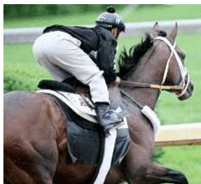
Bluegrass Cat

GI Kentucky Derby runner-up Bluegrass Cat (Storm Cat) breezed five furlongs in 1:00.30 at Belmont yesterday morning. The three-year-old