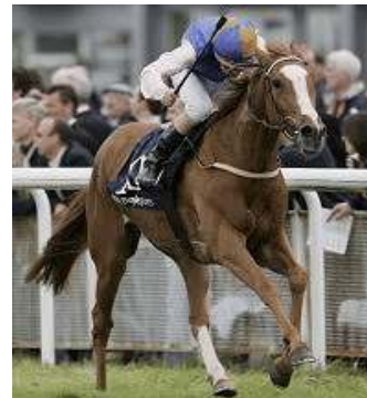
Nightime