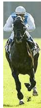
Silent Name