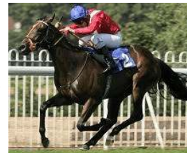
Confidential Lady