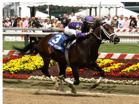
1st Sir Barton S.-L

Sire of Lane's End Sales Grad HIGH COTTON