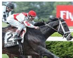
Sunriver