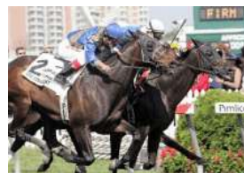
Better Talk Now gets his head down