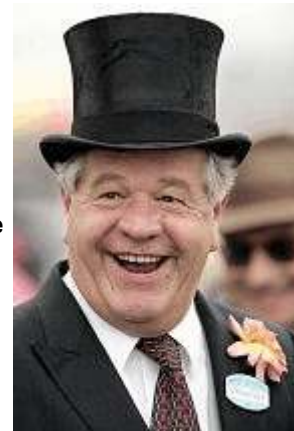
Sir Michael Stoute