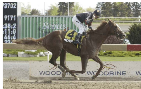
1st Marine S.-G3

Sire of New Graded Stakes Winner MALAKOFF