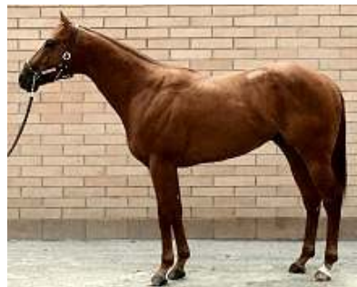
Unbridled Slew