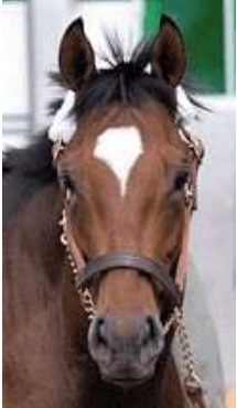
Brother Derek MJC