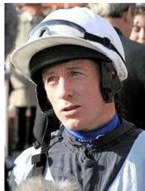
Kieren Fallon