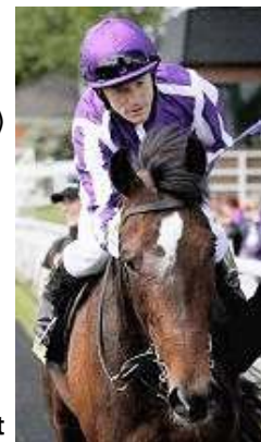
Septimus