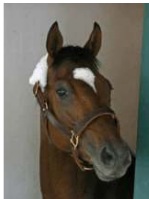
Brother Derek Horsephotos

Since 1984, only one horse has won the Preakness after skipping the Derby. Red Bullet was the last to achieve that feat, when he upset Fusaichi Pegasus in 2000. Six newcomers will try and add their name to that list, including GIII Withers S. victor Bernardini (A.P. Indy) and GIII Gotham S. winner Like Now (Jules).