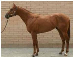
$2.5-million topper

Tuesday and at its conclusion more than one record had been soundly broken. New marks for session-topper, highest-priced filly, gross and average were set; some by a considerable amount. While the RNA rate was 27.5 percent, up from 20 percent last year, those horses that sold grossed $10,514,500, surpassing the previous mark by 37 per-