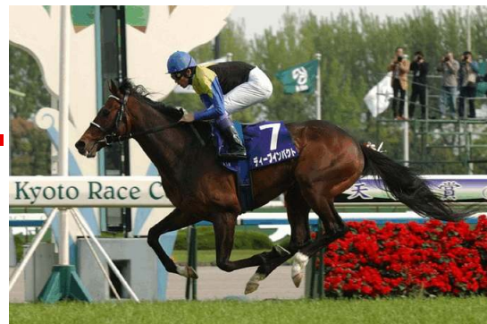
Multiple G1SW, Japan DEEP IMPACT