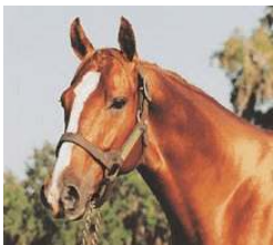
Red Bullet Adena Springs

Unbridled Slew (Red Bullet) caused a sensation when working a record eighth-of-a-mile in :9 3/5 ( video ) and backed up the frenzy with a sale-record price of $2.5 million at yesterday's Barretts May Sale of Two-Year-