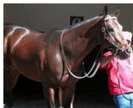
Lost in the Fog Sherackatthetrack