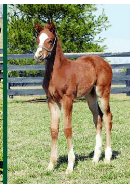
Tapit colt out of Sabathani