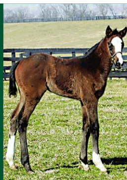
Tapit filly out of Lorline

Power. Passion. Performance. 859-293-2676 www.gaineway.com