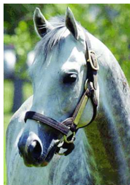
Tapit, G1 winner by Pulpit