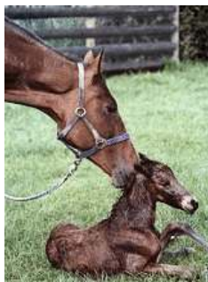
Sunline and '04 Rock of Gibraltar filly