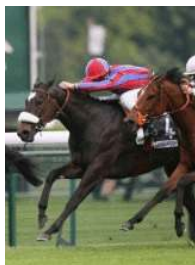
Tie Black A.P.R.H

Tie Black wasn't exactly cheap as a yearling, costing £330,000, but this daughter of Machiavellian must be extremely valuable now, as she comes from a lengthy line of Classic winners and champions.