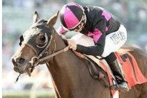
2005 May grad Itty Bitty Pretty

BARRETTS MAY SALE TODAY The Barretts May Sale of Two-Year-Olds in Training gets underway today at 10:30 a.m. local time at the Hinds Pavilion at Fairplex Park in Pomona, California. A total of 378 juveniles have been cataloged for the one-day sale, including horses by the likes of Benchmark, Distorted Humor, In Excess (Ire), Johannesburg, Mr. Greeley, and Tale of the Cat. Several have sparked