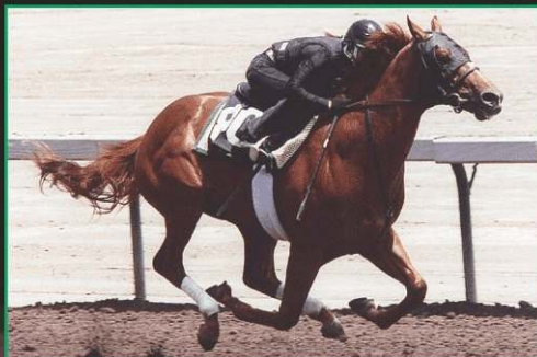
Hip #80 Unbridled Slew, by Red Bullet

UNBRIDLED SLEW recorded the fastest 1/8 work ever by a 2yo at auction – :9.60 seconds