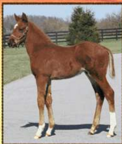
2006 Speightstown - Red N'Gold filly bred by WinStar Farm, LLC