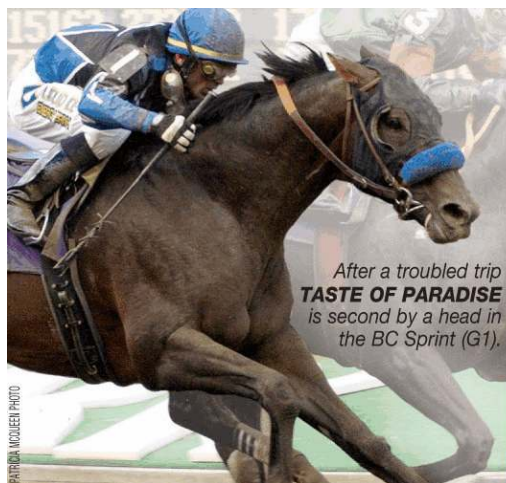
After a troubled trip TASTE OF PARADISE is second by a head in the BC Sprint (G1).