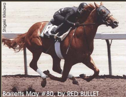
Barretts May #80, by RED BULLET

A son of RED BULLET worked the fastest eighth of a mile in 2YO auction history on May 11th--:9.60