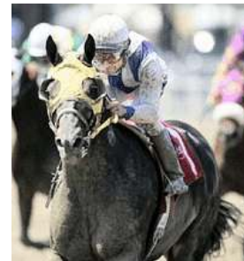
Surf Cat

He trailed early, but Surf Cat (Sir Cat) rolled up the rail on the far turn and swept to the front in the stretch to post an impressive win the GII Mervyn Leroy H. at Hollywood Park yesterday afternoon. It was the fourth straight for the four-year-old, who has been unbeatable since fading to sixth in the GI Pacific Classic last August. Bet down to 1-5, Surf Cat was content to lag early under an active Alex Solis as Spellbinder (Tale of the Cat) set a pressured pace. He took flight when ready, however, sailing past rivals to win going away. "Around the turn, he felt like a train going down hill," said Solis, who swept all three graded stakes at Hollywood yesterday. "He is very powerful. He is better than he was last year."