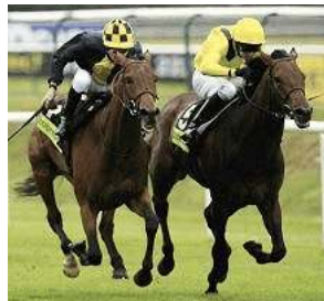
Linda's Lad (left)

Linda's Lad outbattled Hazeymm in a renewal that had its share of drama. The bay showed a progressive profile last term, following a win in the Listed Criterium du FEE at Deauville in August with a second behind Carlotamix (Fr) in the G3 Prix des Chenes in September. Back at Longchamp the following month, he overcame the newcomer Best Name (GB) by a short head to take the G3 Prix de Conde, then added the G1 Criterium de Saint-Cloud to his tally in November. Only fourth in the G2 Prix Noailles back at Longchamp on his seasonal bow Apr. 17, he resumed winning ways under Christophe Soumillon to defy a seven-pound penalty. Settled last of five early, he cruised into contention to join Hazeymm inside the final eighth, getting on top in the final strides. "This was a good trial for my horse and the good-to-firm ground wasn't a problem for him," Soumillon said. "He's always keen and that's why I put him in last, but the pace was good enough and, in the last 400 meters, I thought he'd win easily, but he didn't want to rush. The second is a nice horse, too, and pushed me all the way." There was a sad postscript to the race as Botteen (GB) (Singspiel {Ire}) broke a leg passing the quarter pole and had to be euthanized.