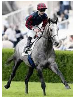
Stormy River