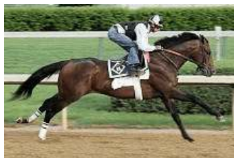
Sharp Humor

Purdedel and WinStar Stable's Sharp Humor (Distorted Humor) has been knocked off the Triple Crown trail by a knee injury suffered in Saturday's GI Kentucky