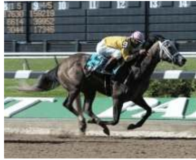
Oprah Winney

Oprah Winney came out of a winning effort against statebred maidens at Belmont in October to win the Dec. 14 Randaroo S. by 2 1/2 lengths. Favored in her next outing, the Jan. 2 Ruthless S., she was a disappointing fourth, but ran