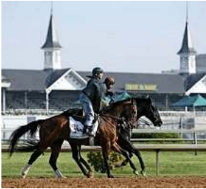
Brother Derek