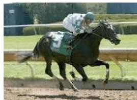
Beautiful Venue

Five Keeneland debut winners face off in the year's