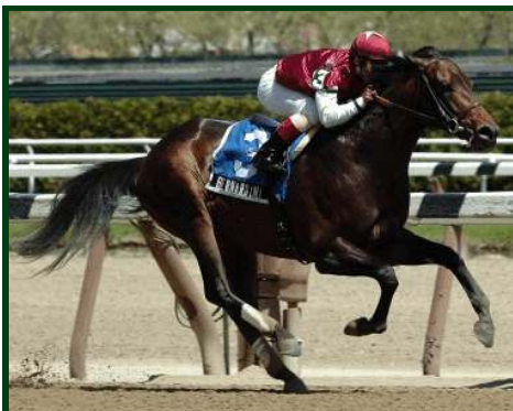
BERNARDINI

Congratulations to Darley! Breeder and Owner of BERNARDINI Winner of the Graded Withers S. & A.P. INDY's 87th STAKES WINNER!