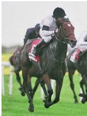
Motivator Ascot Racecourse