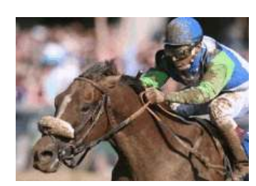
Will Showing Up Show Up?

Already assured of a spot in the Derby, should his connections choose to enter him, is Showing Up (Strategic Mission), winner of the Apr. 22 GII Coolmore