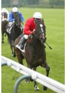
Corre Caminos APRH