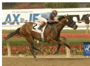
Da Stoops

Da Stoops showed promise in a game second to Your Tent or Mine in last year's seven-furlong GIII Hollywood Prevue S. Responding to the drop to state-bred company in the California Breeders' Champion S. at Santa Anita Dec. 26, the dark bay crushed rivals by an emphatic eight lengths. A runaway winner off the bench in the restricted Sunshine Millions