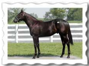
Hip #136, colt by Storm Cat - Ajina

AT THE 2005 KEENELAND SEPTEMBER SALE, TAYLOR MADE SALES AGENCY SOLD A STORM CAT - AJINA YEARLING COLT FOR $3,000,000 AS WELL AS AN A.P. INDY - MAGICALMYSTERYCAT YEARLING COLT FOR $2,300,000 TO JOHN FERGUSON BLOODSTOCK.