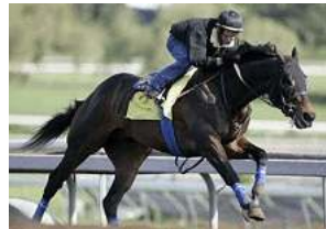
Bob and John

Trainer Bob Baffert was on hand at Santa Anita Park in California for Bob and John (Seeking the Gold) and Point Determined (Point Given)'s final major preparatory move ahead of Saturday's Kentucky Derby. Bob and John, winner of the GI Wood Memorial Apr. 8, who