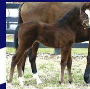
Johar-Hello Soso Filly