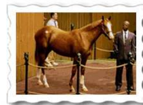
Hip #273, colt by A.P. Indy - Magicalmysterycat

(859) 885-3345 • Fax (859) 887-1754 • www.taylormadefarm.com