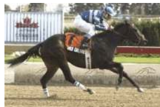
Summer Girlfriend