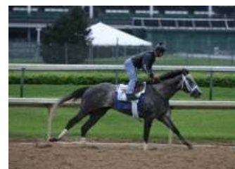
Flashy Bull