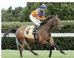
Angara