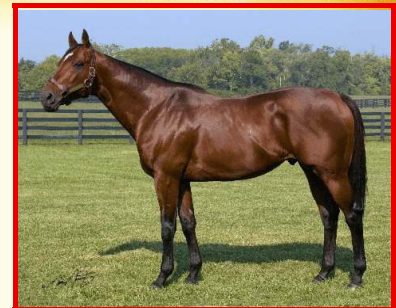
KELA $7,500 LIVE FOAL

On the board 20 of 26 starts at DMR, GPX, HOL, LSX and SAX