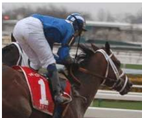
Jazil