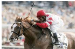
Sweet Return