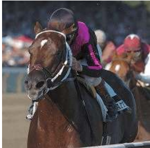
First Samurai