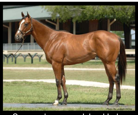
Songandaprayer - Island Lake Hip #879

This newspaper may not be reproduced in any form or by any means, electronic or mechanical, without prior written permission of the copyright owner, MediaVista. Information as to the American races, race results and earnings was obtained from results charts published in Daily Racing Form and utilized here with with the permission of the copyright owner, Daily Racing Form.