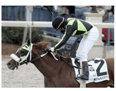
With a City

GI Kentucky Derby hopeful With a City (City Zip) was euthanized Sunday morning after a three-day battle