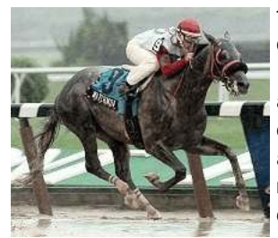
Watchmon A Coglianese

Hidden Brook is also active at the yearling sales, buying to race and occasionally to pinhook, and also