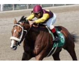
Discreet Cat

That is especially true if you're part of the Hidden Brook Farm team, which foaled and raised the talented three-year-old, winner of the $2-million G2 UAE Derby