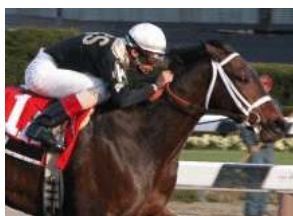
Sis City winning the '04 Demoiselle