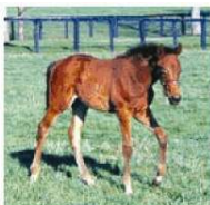
filly out of G2 SW Yell