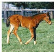
colt out of the dam of Lion Tamer