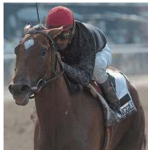
Smuggler