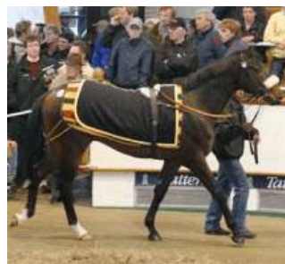
Record-setting hip 451

A colt by Green Desert out of G3 Park Hill S. winner Alexander Three D (Ire) (Pennekamp) provided the icing on the cake in Newmarket last night, bringing a record-breaking 625,000gns at the concluding session of