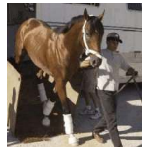
Wild Desert arrives at Woodbine.