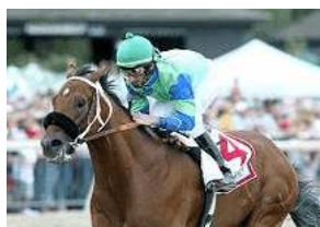
Love of Money all alone in the '04 Pa Derby.