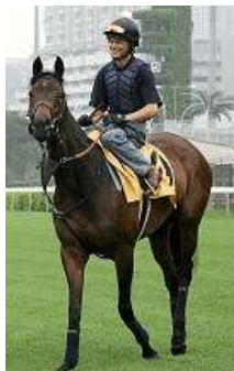
Ouija Board