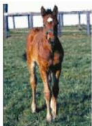
filly out of Danzig's Edge