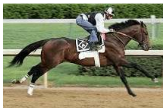
Sharp Humor

GI Florida Derby runner-up Sharp Humor (Distorted Humor) was clocked working a mile in 1:38 flat at