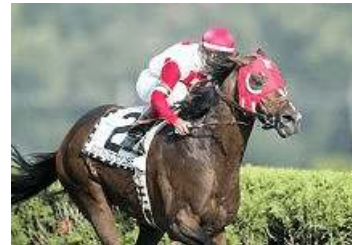
Nothing to Lose