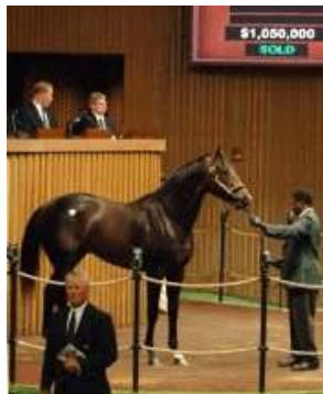
Hip 184