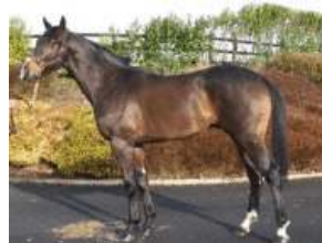
Lot 128 inglis.com.au

Demand was expected to be strong for the offspring of Redoute's Choice (Aus) at this year's Inglis Easter Yearling Sale, and the Arrowfield stallion was able to meet those expectations. Three of his offspring broke the seven-figure barrier at Tuesday's opening session of the sale, including the day's topper, lot 128, a A$2-