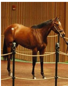
Hip 101