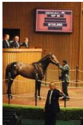
Hip 99

It wasn't just that hip 99 breezed a quarter-mile in an impressive :20.3 at the Apr. 10 under-tack show. It was the way that it was accomplished. The exercise rider lost his right stirrup and was forced to dig his