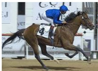
Discreet Cat

DISCREET CAT TO SKIP KENTUCKY DERBY Godolphin's undefeated Discreet Cat (Forestry), commanding six-length winner of Dubai's GII UAE Derby Mar. 25, has been withdrawn from consideration for the GI Kentucky Derby and will not contest any of the Triple Crown races.