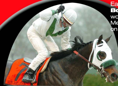
Eaton Sales grad, Bob & John won the Wood Memorial S.-G1 on April 8.