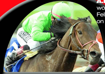
A.P. Warrior won the San Felipe Stakes-G2 on March 18.

Healthy Addiction (Boston Harbor), 5f, :59.40, 2/47 Star Parade (Arg) (Parade Marshal), 4f (tt), :50.80, 1/3