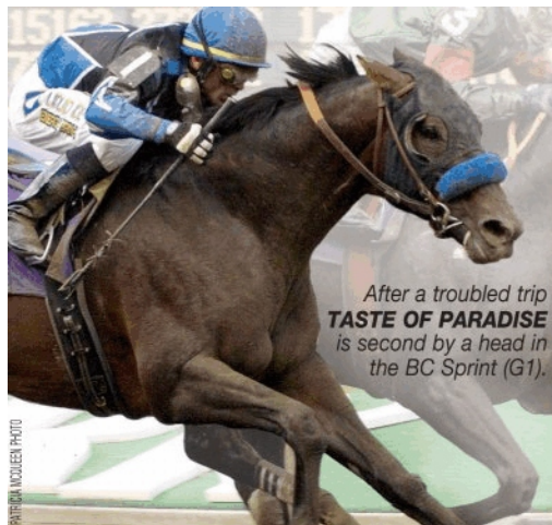
After a troubled trip TASTE OF PARADISE is second by a head in the BC Sprint (G1).