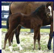
Johar-Hello Soso Filly