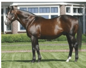
A.P. Indy

"I was sitting at the sale and A.P. Indy had just recovered from colic surgery and here comes a mare through the sale that's in foal to A.P. Indy and the bidding got stuck around $200,000," he explained. "I never really looked at the horse before that, to be honest with you. I say to myself, 'There may not be many more A.P. Indys,' so I took a chance and paid $350,000 for her."