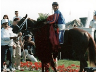
Thunder Gulch

Inaugurated in 1993, the Keeneland April Sale of Two-Year-Olds in Training is easily the baby among the sales company's events. But in its relatively brief history, it has established itself as a reliable source for horses of the highest quality. In just its second year of existence, a chestnut colt by Gulch out of Line of Thunder made his way through the pavilion and, 13 months later, Thunder Gulch found himself draped in a blanket of roses on the first Saturday in May. He was later named champion of his generation.