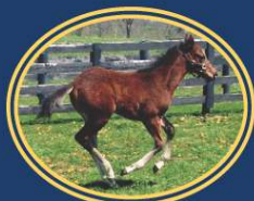
RAVNINA colt at Fallbrook Farm

First Two Books include Over 160 A to A++ Nicks Over 170 Stakes Mares and/or Producers.