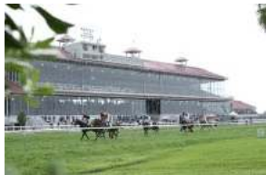
Fair Grounds Horsephotos

Fair Grounds Race Course, which suffered significant damage during Hurricane Katrina last August, has applied to the Louisiana State Racing Commission to host an 81-day meeting in 2006-2007. The historic New Orleans track was forced to move its 2005-2006 meet to Louisiana Downs and repairs have been ongoing since the fall. The roof of the grandstand and clubhouse was completed Mar. 31 and power was restored to the building last week. Backstretch maintenance, including repair and replacement of roofs, doors and stalls, is expected to be completed by the return of racing on Thanksgiving Day, Nov. 23. The first event scheduled to be held at Fair Grounds since Katrina is the annual New Orleans Jazz and Heritage Festival, which begins Apr. 28. The proposed schedule for Fair Grounds' 135th season of racing runs from Nov. 23 through Mar. 25, with racing Thursday through Sunday, with Mondays added in January and February.