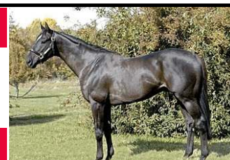
ST. AVERIL • $6,000 LF

Saint Ballado - Avie's Fancy, by Lord Avie