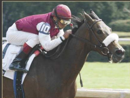
Dubai Escapade-G2 new stakes record at Keeneland