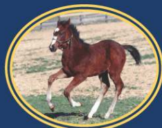
LOTTA KIM filly at Heaven Trees Farm