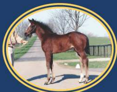
JAMIE'S SUNSHINE filly at Indian Creek