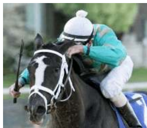
Ready to Please

Click for the brisnet.com chart , the free brisnet.com catalogue-style pedigree or the Video, sponsored by Taylor Made .