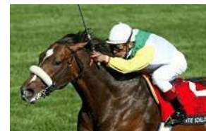
Artie Schiller