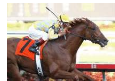
Strong Contender

The lightly raced Strong Contender (Maria's Mon) has only two races under his belt, but may be the most talented horse in the starting gate. The chestnut debuted with a 3 3/4-length maiden tally at Arlington last August at Arlington, then finally resurfaced in a Feb. 22 Gulfstream allowance with a 4 3/4-length victory. The $800,000 KEEAPR juvenile purchase, who stopped the clock at 1:34 3/5 in that eight-furlong test, makes his first start around two turns today. He was excluded from the GII Lane's End S. due to a lack of earnings, and will also likely be shut out from the GI Kentucky Derby if he doesn't finish first here.