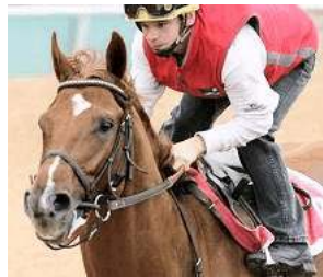
Lawyer Ron

In 2004 an undefeated chestnut named Smarty Jones went on a tear at Oaklawn, winning the Southwest S., the Rebel S. and the GII Arkansas Derby. He would go on to take the GI Kentucky Derby and the GI Preakness S. before suffering his first defeat in the GI Belmont S. Although Lawyer Ron (Langfuhr) isn't unde-