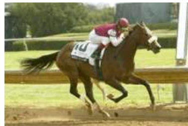
Dubai Escapade

Following in the steps of her older half-sister who won this last year, Dubai Escapade turned in the most impressive performance of her career, posting an easy gate-to-wire victory. The topper at the 2004 Barretts March sale, the bay made just one start that year for Sheikh Mohammed, a fifth over the Nottingham turf