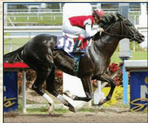
Songster 2nd in Bay Shore Stakes-G3 in his third career start.

#1 by percentage of American graded stakes horses from named foals - 9.25%