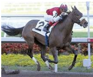
Dubai Escapade

Today's GII Vinery Madison S. gets the ball rolling in what should be a stellar week of racing at Keeneland Race Course. Headlining the seven-furlong affair is Darley's Dubai Escapade (Awesome Again), a $2-million