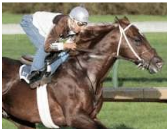
First Samurai