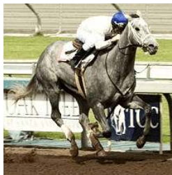
Wild Fit