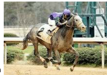
Steppenwolver