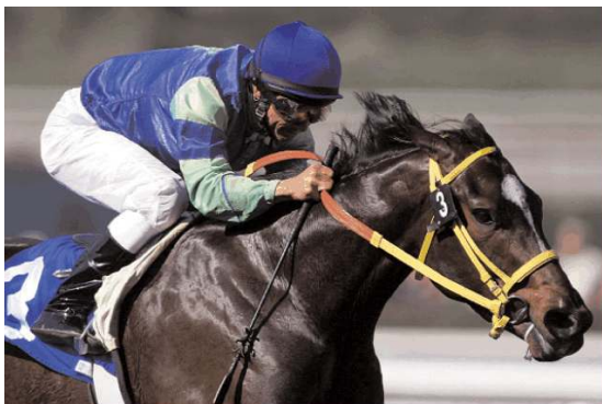
Jay Em Ess Stable's ARSON SQUAD wins SANTA ANITA stakes debut.

TDN TODAY Headline News ..... 8 pages The brisnet.com 'Race of the Day' is the GII Vinery Madison S. at Keeneland. For pps and a complete race analysis, click here .