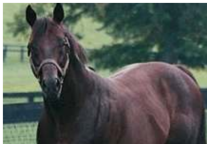
Seeking the Gold

time. I added that "he probably represents a very acceptable risk at his current fee," and suggested that there was every chance that he would bounce back. I'm pleased to say he is doing so. His impressive daughter Pleasant Home put him back on the Grade-I map with her victory in the Breed-