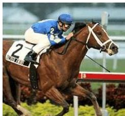
Keyed Entry

Following a gutsy but tired third-place effort by favored Keyed Entry (Honour and Glory) in Saturday's nine-furlong GI Wood Memorial S., it may have looked to some that the mile and a quarter of the Kentucky Derby would be beyond his scope. Even his jockey, Edgar Prado, declared, "I have one less Derby horse now." (Prado is most likely committed to GI Florida Derby winner Barbaro.) But Todd Pletcher, Keyed Entry's trainer, hasn't made a decision on the Run for the Roses, and yesterday announced that his charge will ship to Churchill next Monday. Explaining his decision, Pletcher said, "At the end of the day, I don't think he ran that bad a race [in the Wood]. Maybe with some adjustments--slowing him down a little bit, [running on] a different surface--who knows? I think he at least ran well enough, and has run well enough every start in his life, that we should at least be here to see how he trains over the racetrack and see how he's doing, and not make a decision, prematurely, one way or another."