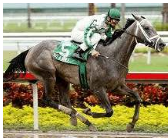
Wait A While

GI Ashland S. runner-up Wait A While (Maria's Mon) will likely appear next in the GI Kentucky Oaks on Friday, May 5, said trainer Todd Pletcher, who reported he was pleased with filly's effort Saturday. "She ran very well," he said. "Right now, the plan is to go to the Oaks if she comes out of the race [Ashland] okay." A dominating 14-length winner of the GII Davona Dale S. at Gulfstream Feb. 4, Wait A While was third in the Mar. 5 GII Bonnie Miss S. before filling the exacta under Bushfire (Louis Quatorze) in the Ashland. The gray, winner of the Miss Grillo S. as a juvenile, has missed the board just once in seven starts for earnings of just over $300,000.