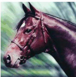
OFFICER Dominant 2YO, Champagne S.-G1, etc.