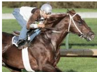
First Samurai

After an exciting weekend of stakes loaded with Kentucky Derby implications, the focus now shifts to next Saturday and the GI Blue Grass S. and GII Arkansas Derby. The races are the last major preps before the Run for the Roses and, save for a runner that may punch his ticket via the Apr. 22 GII Coolmore Lexington, will all but settle the Derby line-up. For