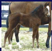
Johar-Hello Soso Filly