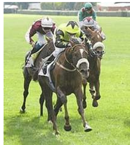
L'Opera winner Kinnaird

BREEZE-UP SEASON HEATS UP Doncaster Bloodstock Sales Company opens the doors for its annual Breeze-Up today against the backdrop of unprecedented