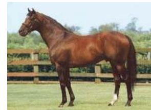
Fusaichi Pegasus

Doncaster has seen a greater influx of the progeny of U.S.-based sires in recent times and among the offerings this time are two-year-olds by Arch, Cherokee Run, Elusive Quality, Fusaichi Pegasus, Gone West, Gulch, Smoke Glacken, Tale of the Cat and War Chant, while those with their first crop include Came Home, Johannesburg and Three Wonders. Fusaichi Pegasus is responsible for two of the standout lots, who on pedigree would not be out of place in any catalogue. Hip 226 , from premier consignor Mocklershill Stables, is a son of Korveya, making him a half to Hector Protector, Bosra Sham and Shanghai, while Oaks Farm Stables' hip 37 is a half-brother to the G1 Ancient Title Breeders' Cup H. winner and top sprinter Avanzado (Arg). Buyers will also get the chance to buy into Came Home with Oaks Farm offering hip 98 , a half to stakes performers from the established Juddmonte family of G1 1000 Guineas winner Wince (GB) and her daughter, the G1 St Leger runner-up Quiff (GB).